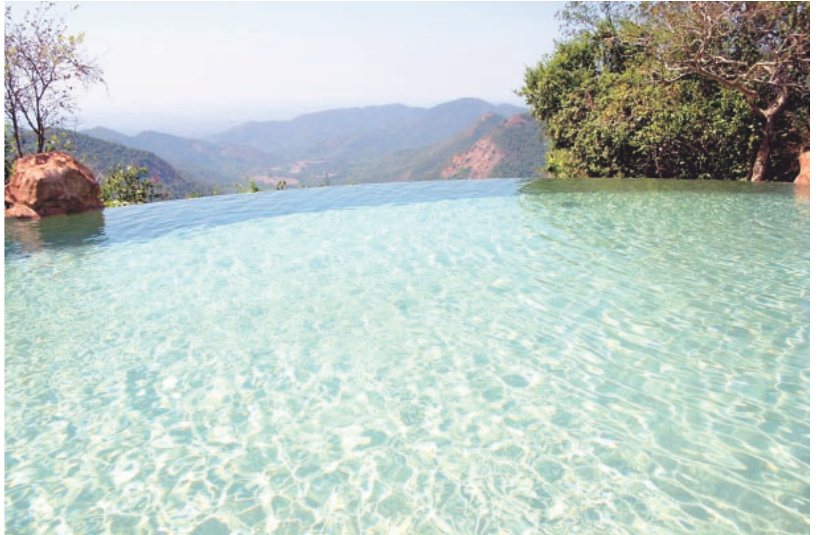
Our Infinity Swimming Pool

R etreat into our cascading swimming pool and have a date with the horizons for a change!