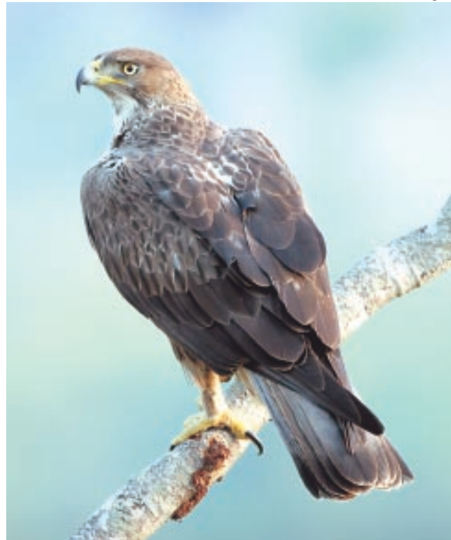
Bonellies Hawk Eagle

Wilderness also boasts of a varied species of medicinal plants and shrubs which host an even more bewildering diversity of butterflies and moths like the Southern birdwing the blue Mormon, the Lunar moth and Atlas moth.