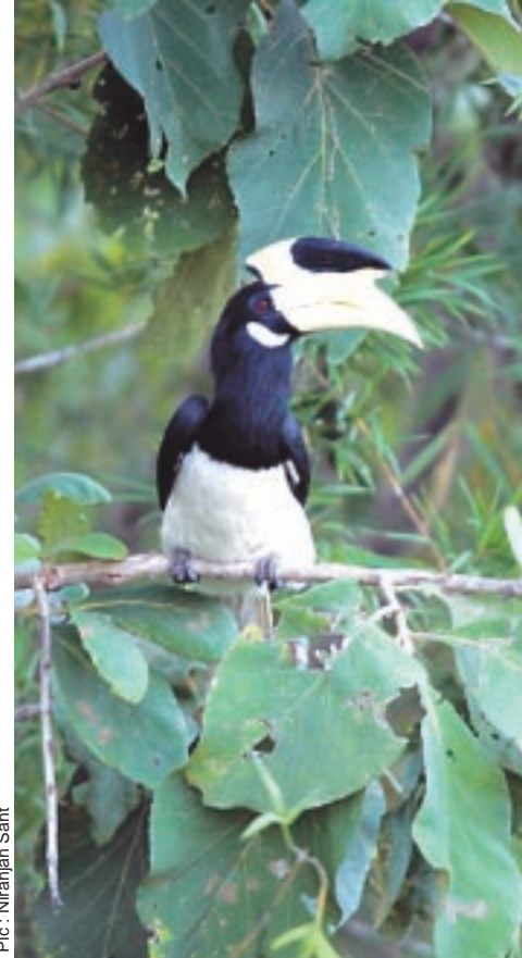
Malabar Pied Hornbill