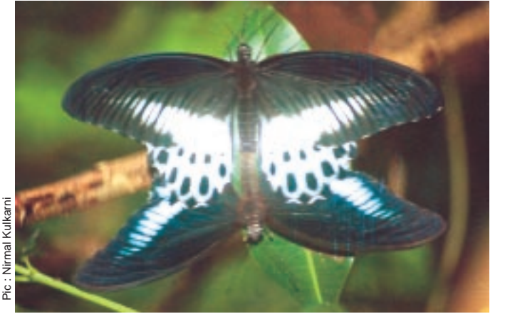
Mating blue mormons