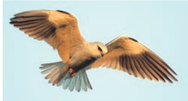
Black Winged Kite